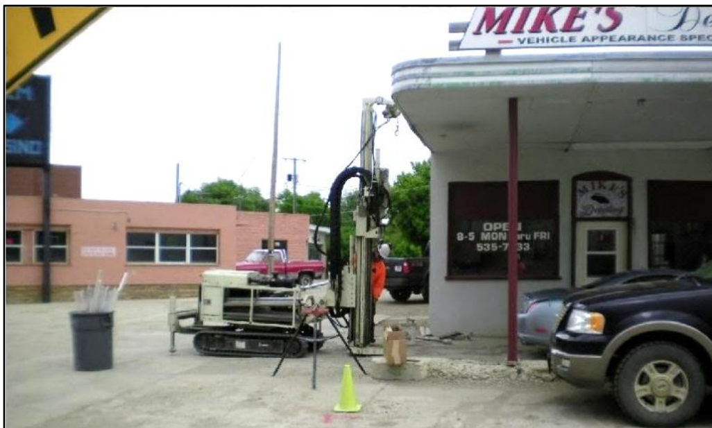
Geoprobe advancing borehole.

Petroleum Tank Release Compensation Funds Spent: UPDATE