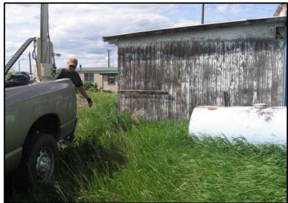
Geoprobe drilling next to waste oil AST in rear of facility.