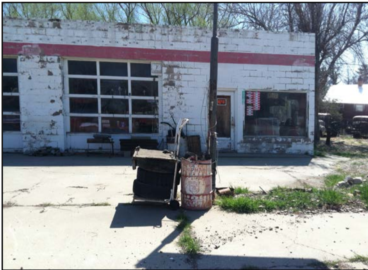
Front of Caldwell Service Station. The former dispenser island was located in the grassy area.

Petroleum Tank Release Compensation Funds Spent: UPDATE