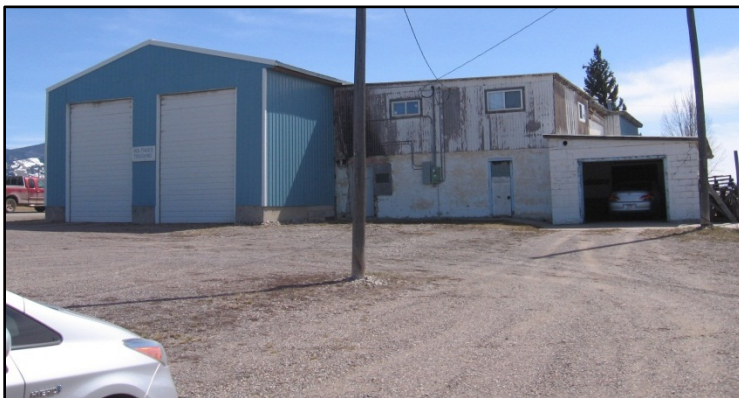
Front of facility. The left half of the building is new construction.

Petroleum Tank Release Compensation Funds Spent: Not Eligible