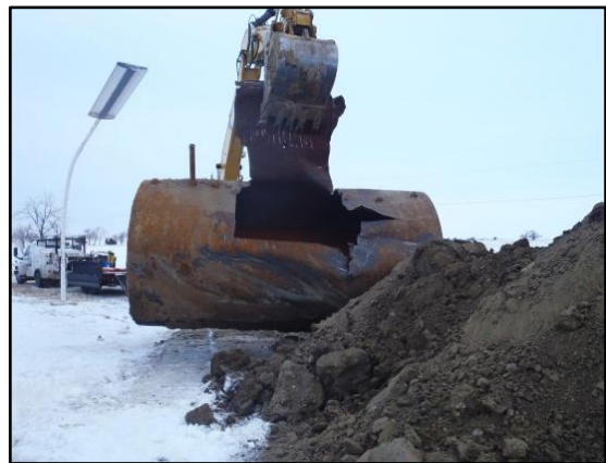
Removal of substandard tanks, January, 2014.