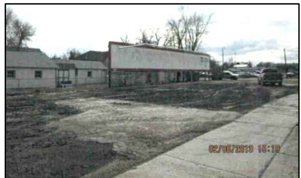
View of the property, previously abandoned, following DEQ excavation, February 2013.