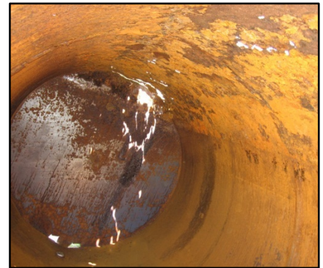
A third tank was discovered by following piping. Photograph shows condition of this tank.