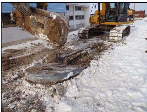
Removal of former dispenser islands, January, 2014.

Petroleum Tank Release Compensation Funds Spent: Not Eligible