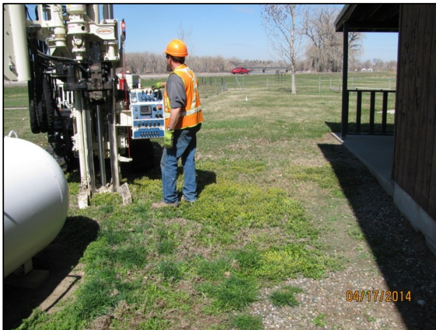
Soil boring installation at the former heating oil UST location. Cottonwoods in the background mark the edge of the Yellowstone River.

Petroleum Tank Release Compensation Funds Spent: UPDATE