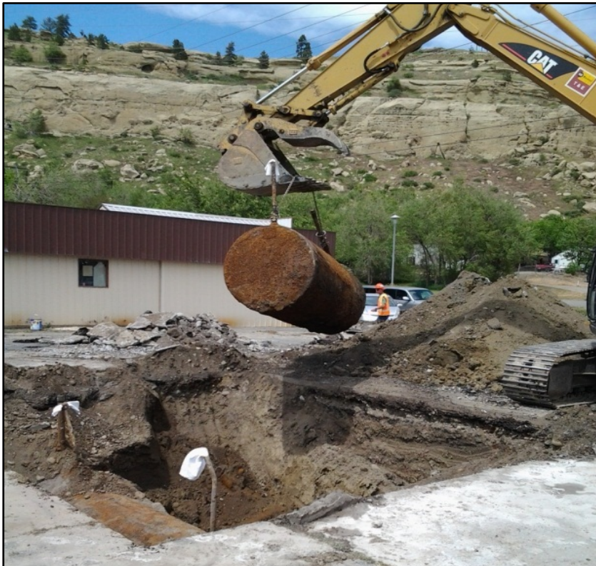
Removal of the first 1000-gallon underground storage tank. Billings Rim Rocks in the background.

Petroleum Tank Release Compensation Funds Spent: None