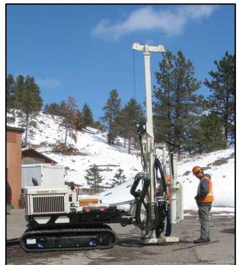
Soil boring at former Coal Corral.