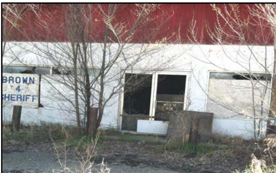
Left: Broken glass in windows and door at Former Brown's Valley Grocery.

Petroleum Tank Release Compensation Funds Spent: Not Eligible