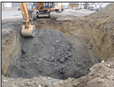
Excavation of 140 cubic yards of heavily contaminated soil.

Petroleum Tank Release Compensation Funds Spent: Not Eligible