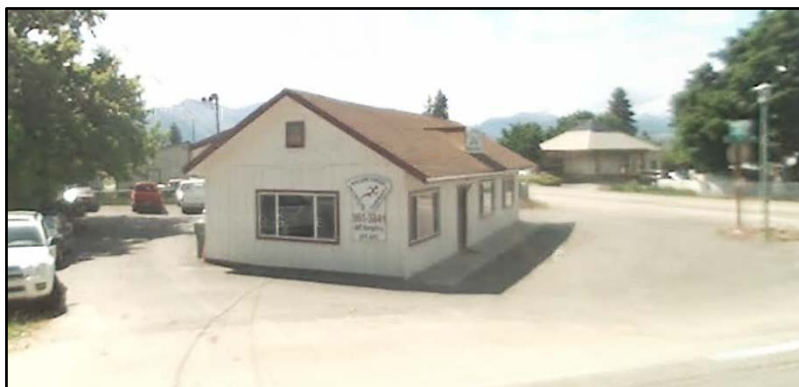
Former Chiropractor Office, Corvallis, Montana.

Petroleum Tank Release Compensation Funds Spent: Not eligible