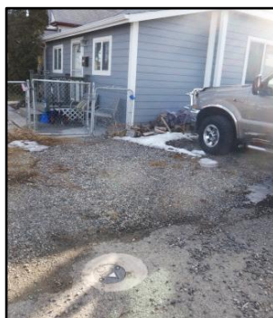
Monitoring well showing proximity of contamination to residences.