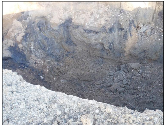
Gray, petroleum contaminated soil, before it was removed via excavation, 2011.