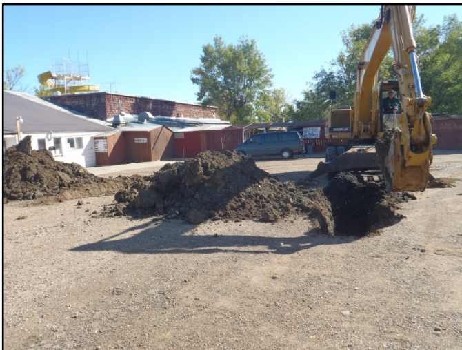
Digging test pits to determine the extent of soil contamination.

Petroleum Tank Release Compensation Funds Spent: Not Eligible