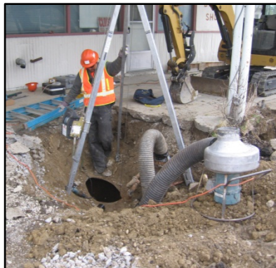
Holes cut in the top of tanks in order to clean and fill them with concrete slurry.