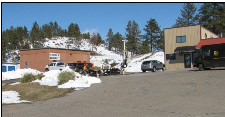
Soil boring at former Coal Corral. where there are currently two small businesses, April, 2014.

Petroleum Tank Release Compensation Funds Spent: UPDATE