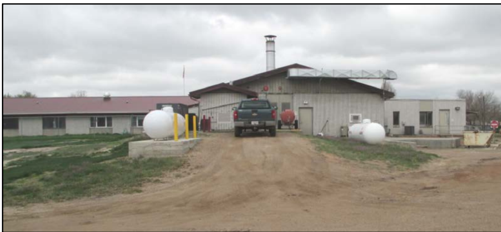
Looking northwest from the rear of the Powder River Manor. The pickup truck is parked over the location of the former underground storage tank.

Petroleum Tank Release Compensation Funds Spent UPDATE