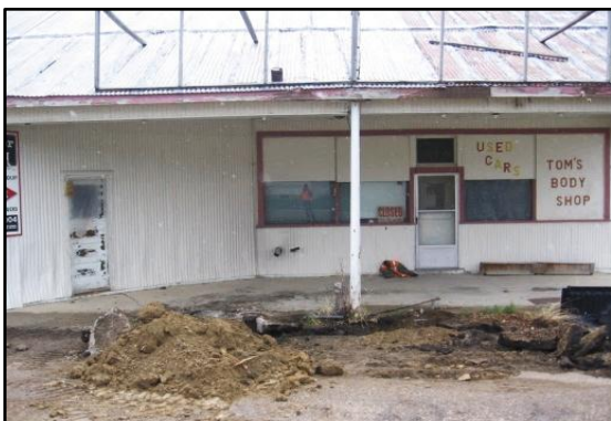
Front view of the building during the tank closure.

Petroleum Tank Release Compensation Funds Spent: Not yet determined