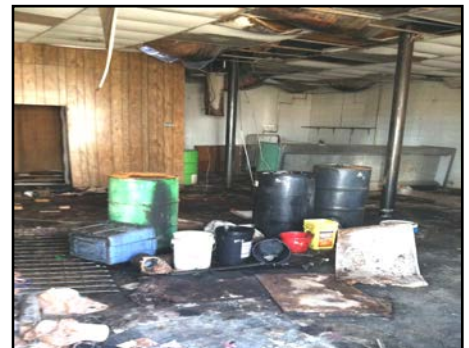
Right: Containers of petroleum and spills within the store prior to cleanup.